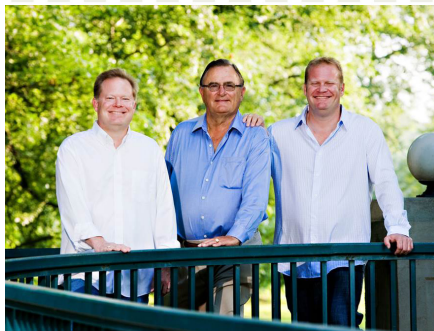
Maple Leaf Farms Duck Farm Leesburg, Ind.

Indiana ranks first among all states for duck production, and our fourth generation family business has been proudly raising ducks in the Hoosier state for more than 50 years. Although our family enjoys traditional duck dishes like roasted Duck à l'Orange and grilled duck breast, we also love sharing duck recipes, like this duck salad, that showcase how versatile and nutritious duck can be.