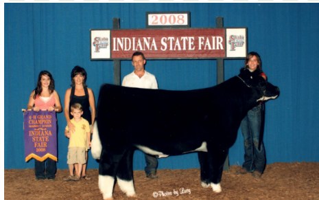
The Martin Family Beef Farm Kingman, Ind.