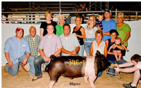
The Watson Family Hog Farm Mooreville, Ind.

“Fun Facts:” Watson’s started showing at the Indiana State Fair in 1962. They had many years of 4-H with 4 children in both the 4-H and open shows.