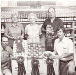
Tuttle Orchards Produce Farm Greenfield, Ind.

Tuttle Orchards near Greenfield is owned by members of the Tuttle/Roney family. They have exhibited produce at the Indiana State Fair for more than 50 years. Tuttle Orchards features apples, pumpkins, plants and local food. The year-round farm store offers apples and cider and lots of local produce, meat and other products.